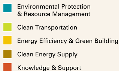
Figure: Direct production jobs in BC's Clean economy sector in 2010.